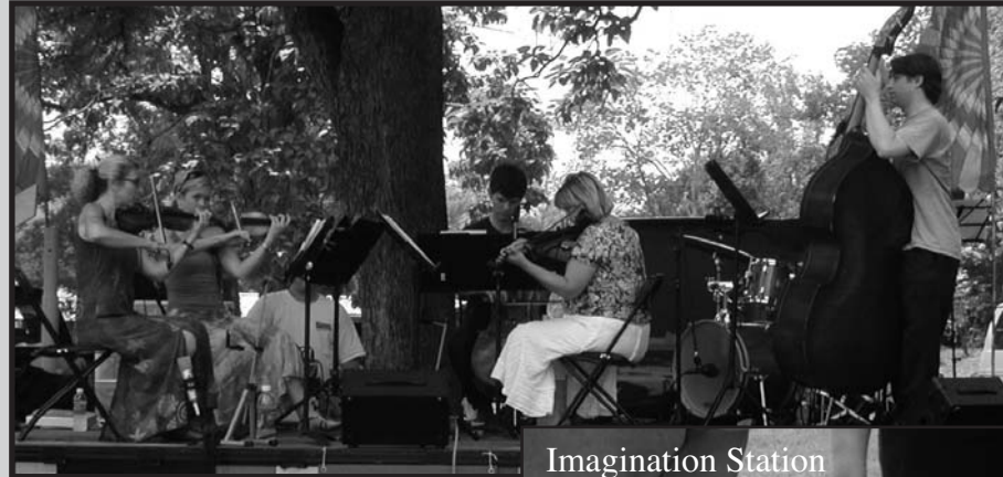
MUSIC & CHILDREN'S ART